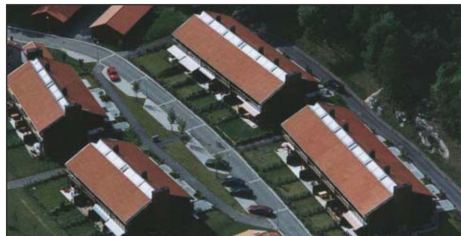
Energy efficient housing without conventional heating at Lindås, a suburb of Göteborg.

Energy storage in a Hydrogen Society. In a global energy system relying on solar electricity and wind power for a major proportion of the energy supply there is a great need for energy storage. The reversible fuel cell makes hydrogen for storage when there is an excess of renewable electricity and makes electricity from hydrogen when needed. The hydrogen storage and fuel cells can be found on all levels, from large central plants to smaller plants in the neighbourhood and in houses. The mopeds, cars, buses and trucks all use fuel cells.