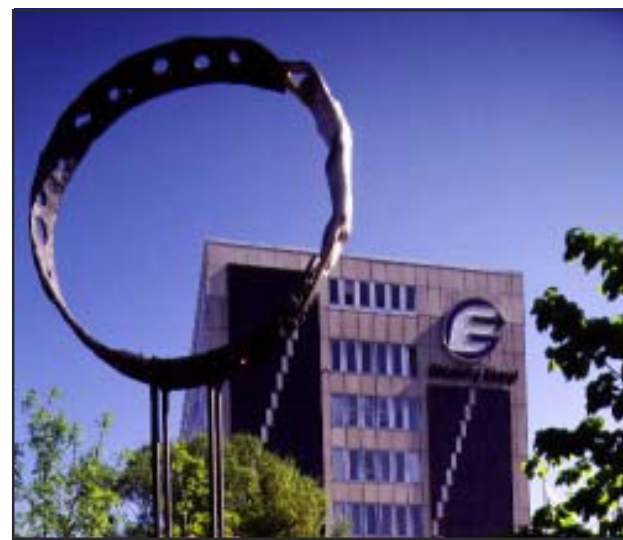
Solar cells on the Göteborg Energy AB office building.